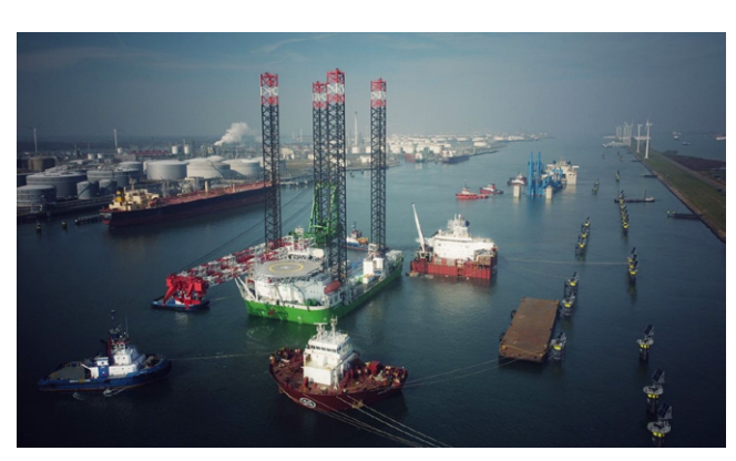
OFFSHORE FACILITY CALAND KANAAL